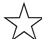
State of Maine Flag, State of NH Flag, or Grange Flag (choose at least one)

No commercial mixes are to be used. All items must be made from scratch. If a junior entry, please state child's age in the space provided on the entry form. Please bring items in a disposable container. All items will be sprayed with a preservative after judging and disposed of after the fair. Amateur Bakers only. Please add a "Y" after the lot # to denote a junior entry.