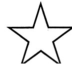
State of Maine Flag, State of NH Flag, or Grange Flag (choose at least one)